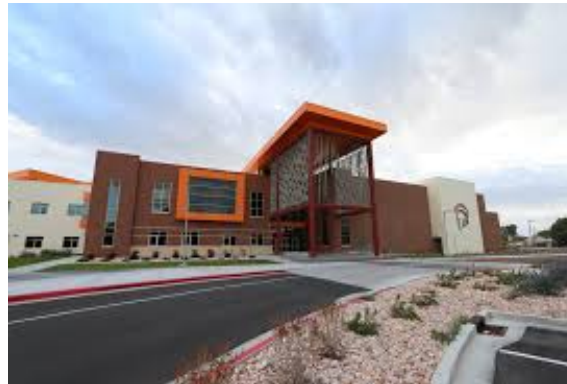
Midvale Middle School completed in 2017

Canyons School District started in 2009 after the Jordan School District split. It was the first district in the state to be created in over 100 years. Canyons is the 5th largest school district in Utah. It serves the communities of Sandy, Draper, and Midvale. Canyons serves 35,000 students in 29 elementary